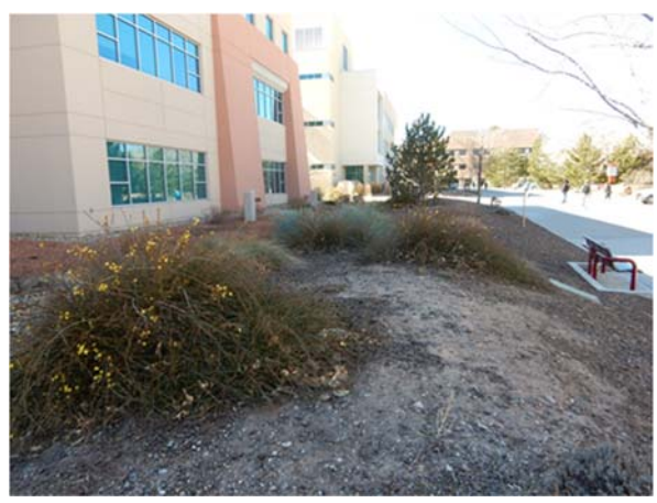
Located north of the College of Education building, Greek Life students will install mulch to improve the look of this area.

Students will paint benches and crosswalks, clean out landscape planters, install mulch in planters and around trees, clean up an empty